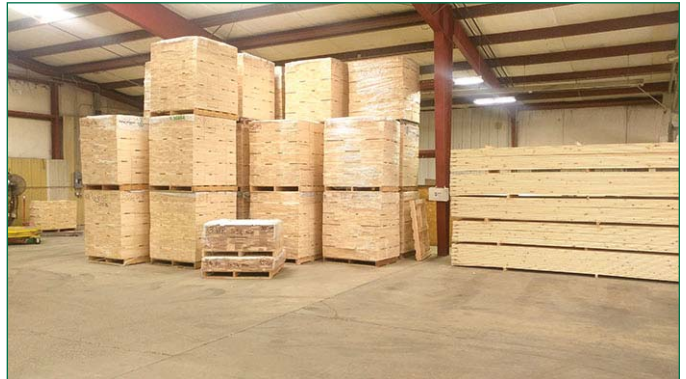
Finished product wrapped and ready!

Orchard Wood Products supports the Baker County community by investing in youth programs and promoting many community projects and organizations throughout the local area. Orchard Wood Products actively supports and sponsors Baker County’s 4-H, Little League, YMCA, and High School sports, and Boy Scouts of America. It has also donated custom mouldings, floorings and casings to many Historic Baker City building restoration projects.