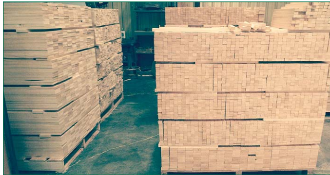
Orchard Wood Products produces a wide variety of small component parts.

The Orchard Wood’s customer base ranges from mega companies to smaller entities including: Boise Cascade Corporation, East Cascade Products, Thermwell Products Company, Woodstream Corporation and Young Brothers Stamp Works. Many of these products can be found in home and lumber stores such as Lowes, Home Depot, Menards, Ace Hardware, and Wal-Mart.