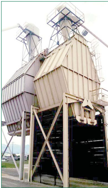
The chip bins collect daily wood shavings