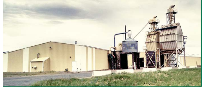
Orchard Wood Products utilizes a 30,000 square foot facility in Baker City, Oregon.

Established in 1957, Orchard Wood Products, Inc., is family owned and operated with over 50 years of experience in the wood products industry. Located in Baker City, Oregon and adjacent to Interstate 84, the facility is centered in the heart of the largest coniferous forest in the Pacific Northwest. The central location provides access to the best resources of pine, fir, hardwood, poplar and redwood. Orchard Wood Products has a 30,000 square foot facility and specializes in custom millwork, moulding and small component parts.