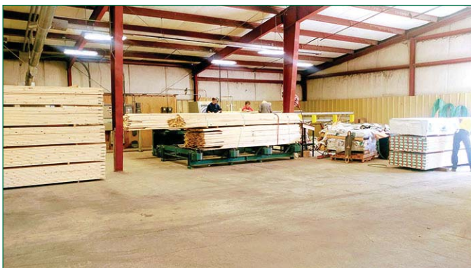
Seasoned workers teaming up on the optimizing chop saw.

Maintaining a healthy forest for future generations is part of the success of the company and its customers. This foundation is based upon a commitment to meet and exceed the expectations of customers through maintaining a consistent level of precision and excellence with every product it manufactures. From California to Maine, Orchard Wood Products supplies both large and small companies with a variety of wood products made exactly to customer specifications.