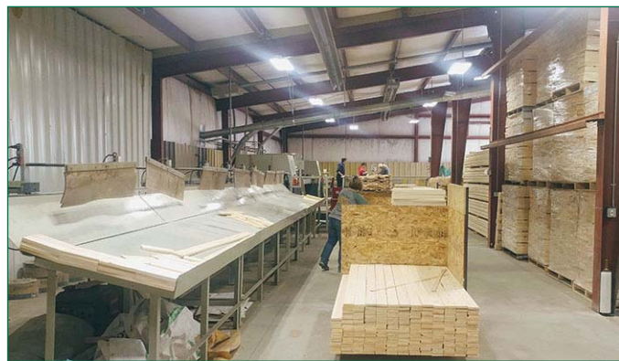
Orchard Wood Products is equipped to manufacture moulding and siding to small toy parts. This is a view of the optimizing chop saw from end-to-end.

“We have always been satisfied with the support and services from TPM. This last year TPM provided us with on-site First-Aid and CPR training that was affordable and effective. We have always taken advantage of the excellent HR advice from TPM for our employee handbook and company policies revisions.”