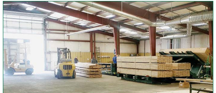
Linear moldings are a standard product produced at Orchard Wood Products. The employees handle the wood in/out feed from the moulder.

Orchard Wood Products has a proactive approach to customer service, and the foresight to re-tool the business in order to meet the changing demands of the marketplace. Recently, an Optimizing Chop Saw with automatic optimizing cross-cut saws, was added to the cutline. The modernization provided a noticeable increase in productivity.