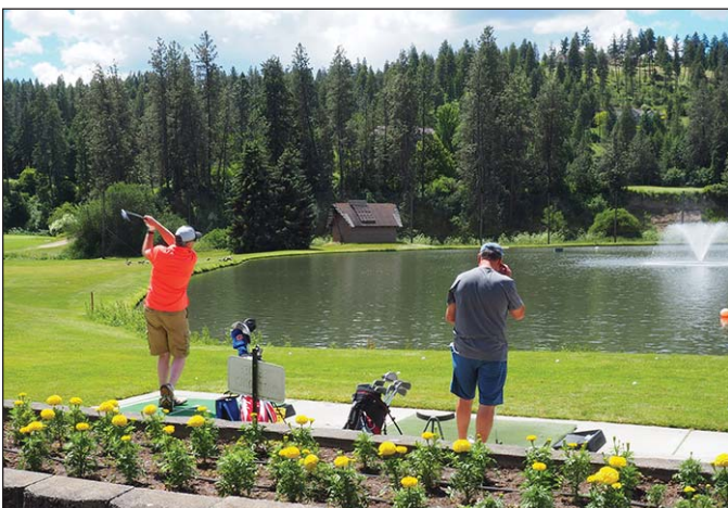
Practice and warm-up on the water driving range.