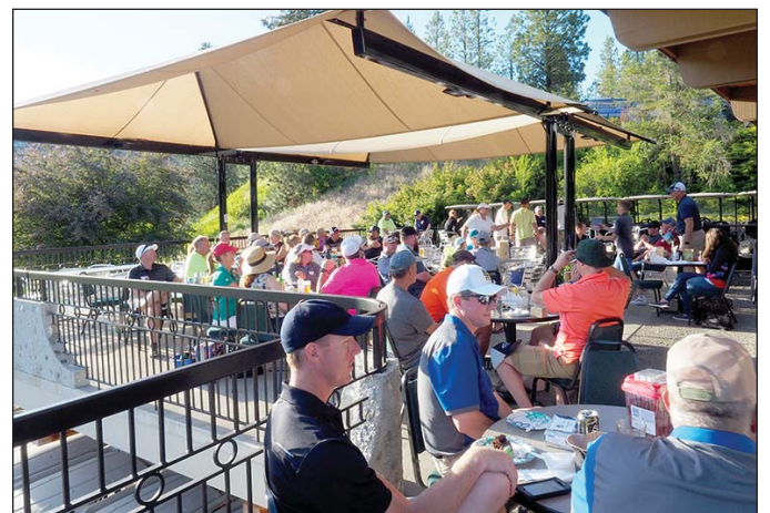
Dinner and Social on the patio at Hangman Valley Golf Course.