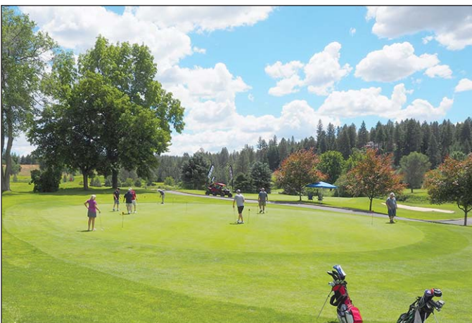
Putting green warm-ups before starting play.