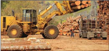
The worker looking at the ground is NOT far enough away to avoid injury if there is a problem while loading the truck.

Workers must remain a safe distance away while a truck is being loaded.