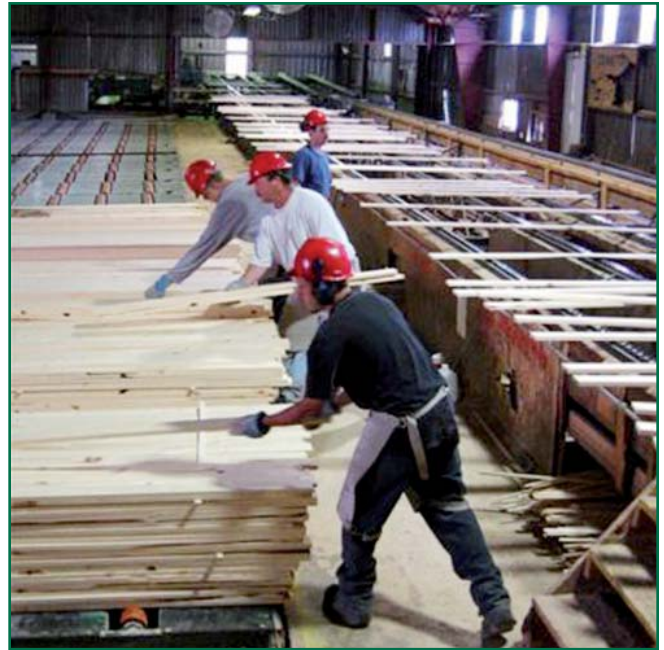
The last stop for a board is the dry chain. Finished lumber is manually stacked into bunks and then steel banded.