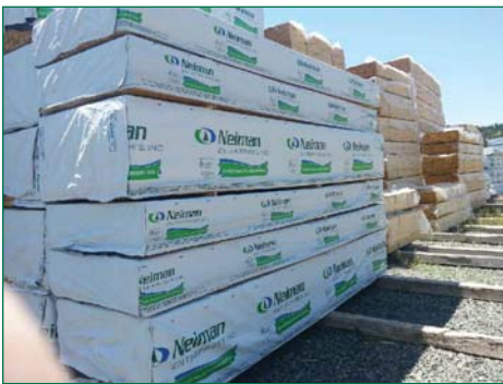
Neiman Enterprises, lumber wrapped and waiting to be loaded.