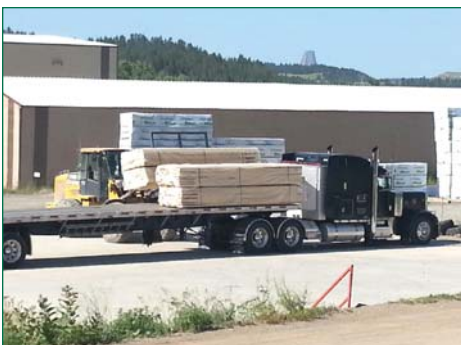
Ron Bears, Planer Supervisor, loading a lumber truck.

Neiman Enterprises, Inc. has a stable of four sawmills. The first is Devils Tower Forest Products located in Hulett, Wyoming. Devils Tower is also the headquarters for the group. This mill concentrates on producing shop lumber for window companies.