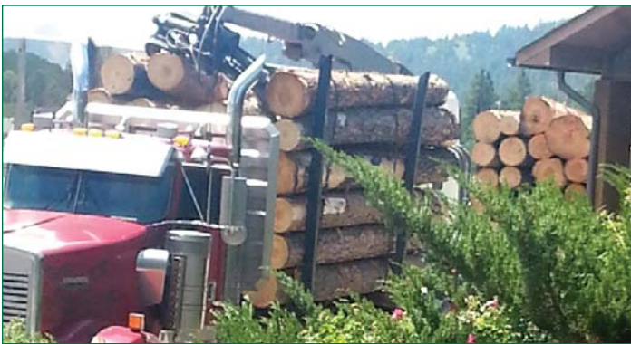
Log trucks bringing a fresh supply for processing.