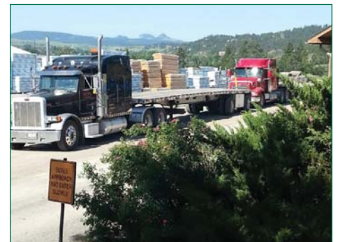
Lumber trucks waiting on deck to go down and be loaded.