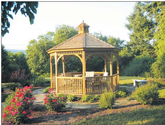
Copper Azole treated pergola

environmental regulations; 2.) continually improve its standards of treatment; 3.) introduce technological advancements to its manufacturing process; 4.) reduce toxic substances where possible; and 5.) review its products and procedures on an ongoing basis. The guiding principle of the company is “common sense environmentalism,” by which it means sound environmental practice based on supported scientific data and consideration of practical alternatives.