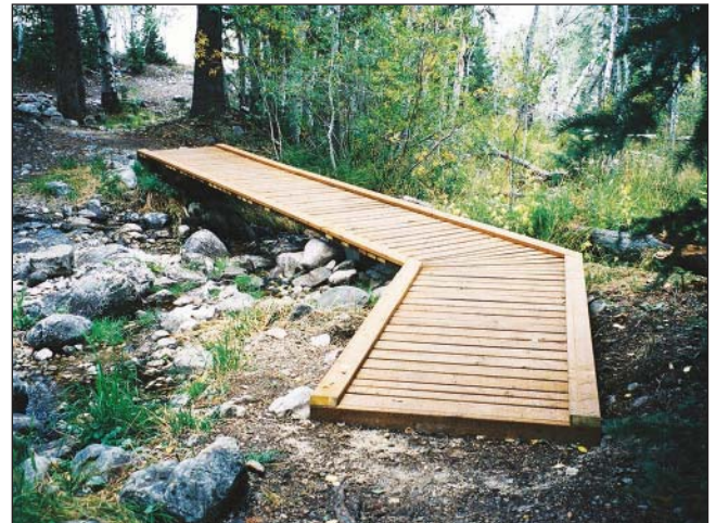
CA-C nature path walkway

precision end trimming, drilling and planing are also available for items like crane pads, decorative posts, bridges, docks and light posts. Drafting, shop drawings and engineering can be provided upon request.