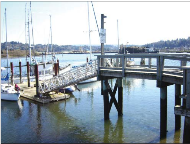
ACZA pilings and docks, Coos Bay, Oregon

CFP is the world's largest producer of treated Douglas Fir that conforms to standards of the American Wood-Preservers' Association. It also preserves western hemlock, hem-fir, ponderosa pine, and other species. The product line includes lumber, timbers, posts, piling, plywood, and glue-laminated members, pressure-treated with one of four preservative formulations. The company also supplies untreated lumber, plywood, and beams. Conrad Forest Products serves the industrial, utility pole, heavy construction, marine, rail and retail markets in long-lasting building materials where wood destroying organisms exist or may be a threat.