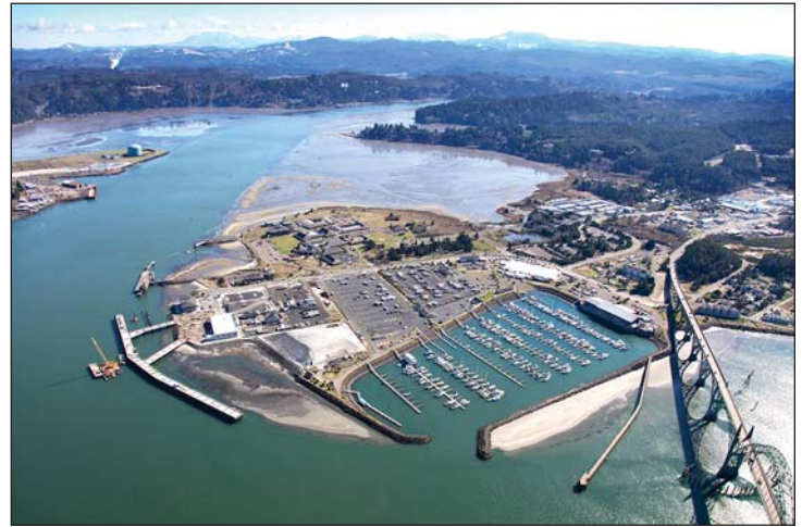
New Noaa facility, Newport, OR

Early in the history of the company - at about the time of the first Earth Day - it made a commitment to its employees, community, and the environment to provide its service in an environmentally sound and scientific way. Conrad Forest Products works to: 1.) meet or exceed all