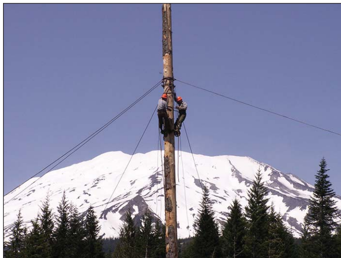
Preparing a spar tree for high-lead logging.