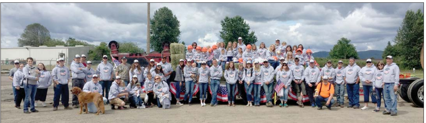
Chilton Logging, Inc. participating in the local Woodland, WA Planters Day Parade.