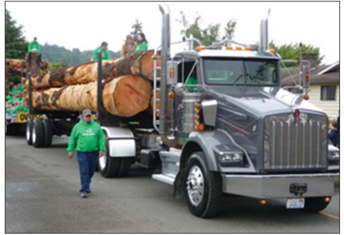
Parade log load ready to go.

Chilton Logging currently has approximately eighty highly skilled employees and offers an exceptional level of service. In order to entice qualified personnel, Chilton Logging offers a competitive benefits package for all employees.